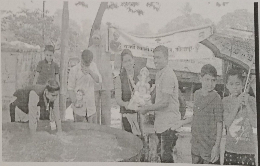
Students participating in Nirmalya Dan and Immersed Ganpati Idol Donation Campaign to prevent water pollution

Awareness program on environmental conservation was conducted on 7th September 2019 on behalf of the Department of Sociology of the College. In this program, students from the Department of Sociology took an active part in the campaign to prevent water pollution and donate immersed Ganpati idols. Also, in order to create awareness among the people about environmental conservation, awareness was created among the citizens on the issues of environmental awareness, rescue of daughters, banning of plastics, ban on plastics etc.