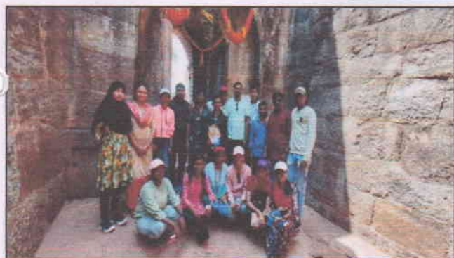
Photo: Study Visit to Sindhudurg fort