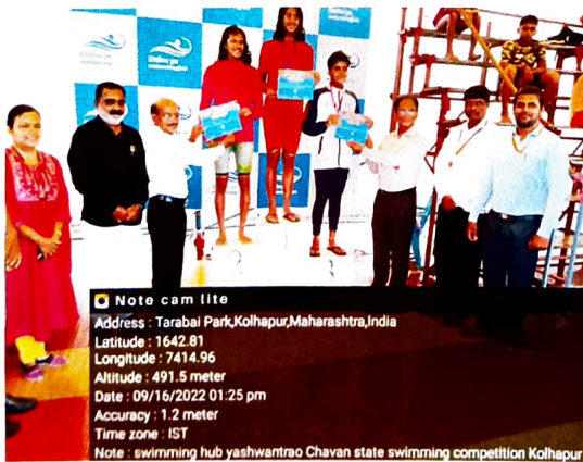
Photo Gallery - Yashwantrao Chavan State Level Swimming Competition