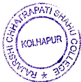
Principal, Rajarshi Chh. Shahu College Kolhapur.