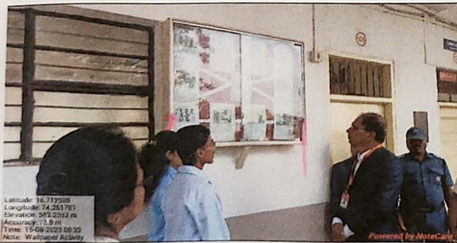
Representation of Wallpaper by our Students