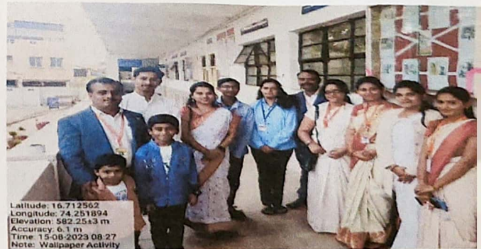
Participants and our Staff Members