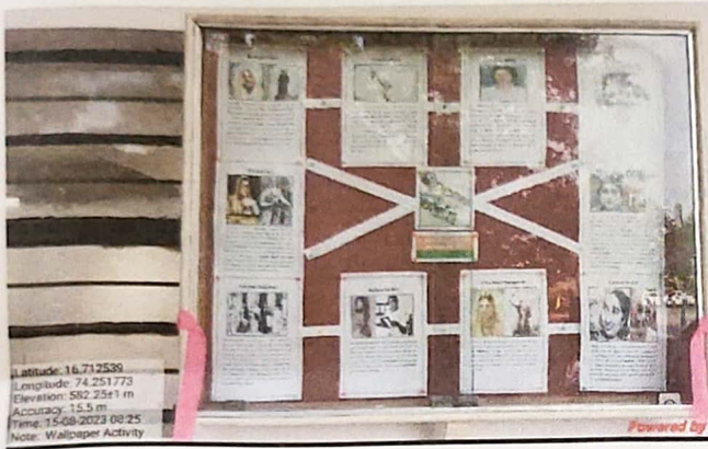
Wallpaper on Contribution of Women Freedom Fighters of India