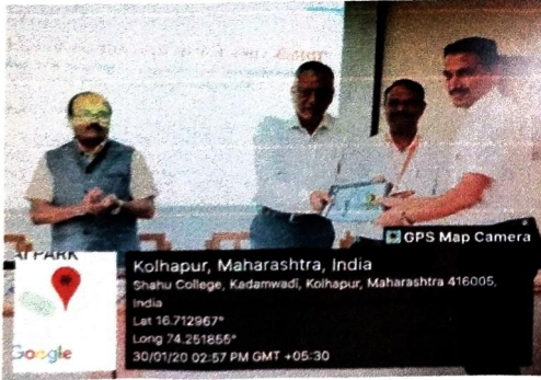
Welcome of company delegates