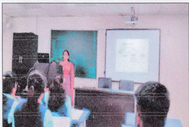
Photo: Guest lecture on Regeneration and French flag anatomy