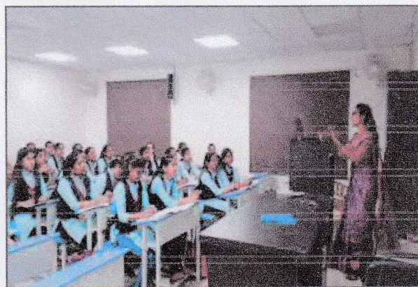
Photo: Student from B.Sc. III Biotechnology, VCK