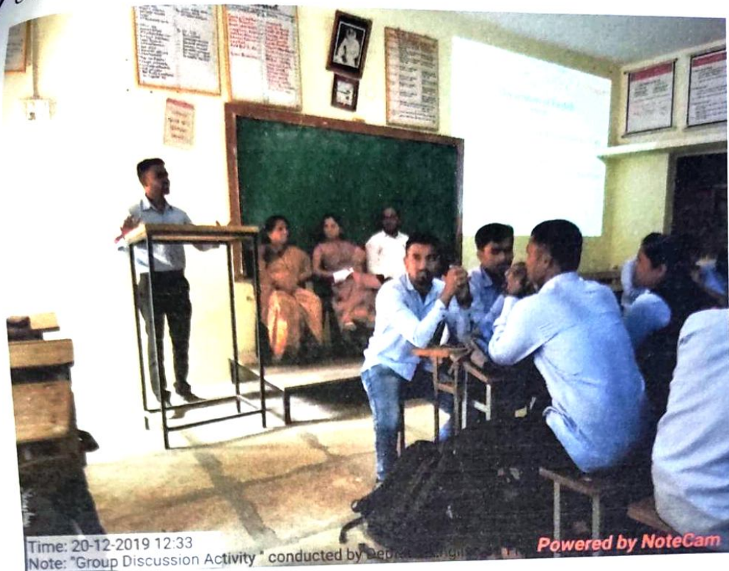
STUDENT PARTICIPANTS FOR GROUP DISCUSSION