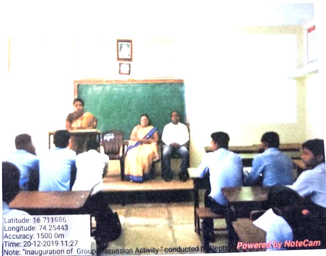
INAUGURATION OF GROUP DISCUSSION ACTIVITY HELD ON 20/12/2020