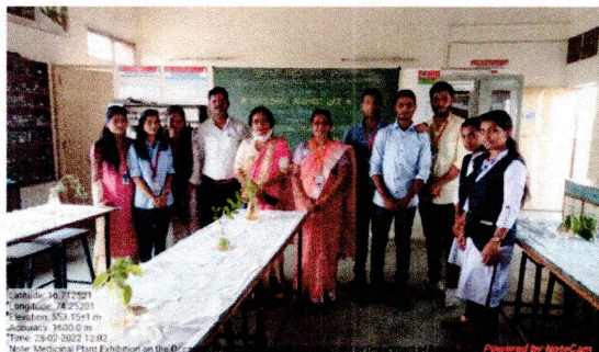
Student participation in Exhibition