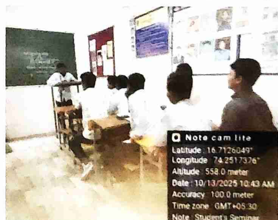
Students presenting their topics