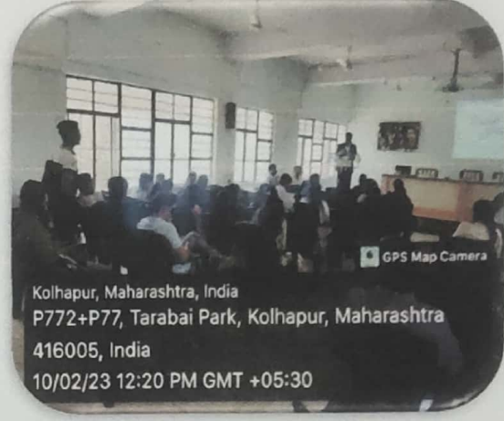
Interaction with participants