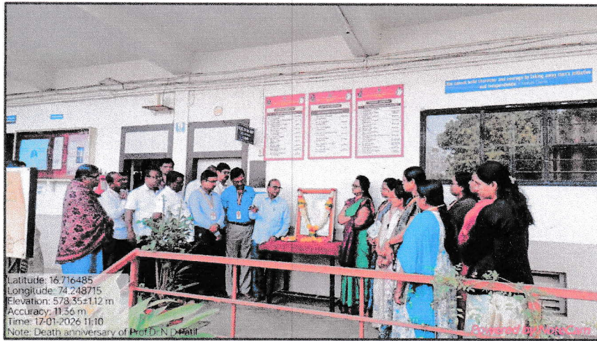
Photo: Celebration of Death anniversary of Prof. (Dr.) N. D. Patil