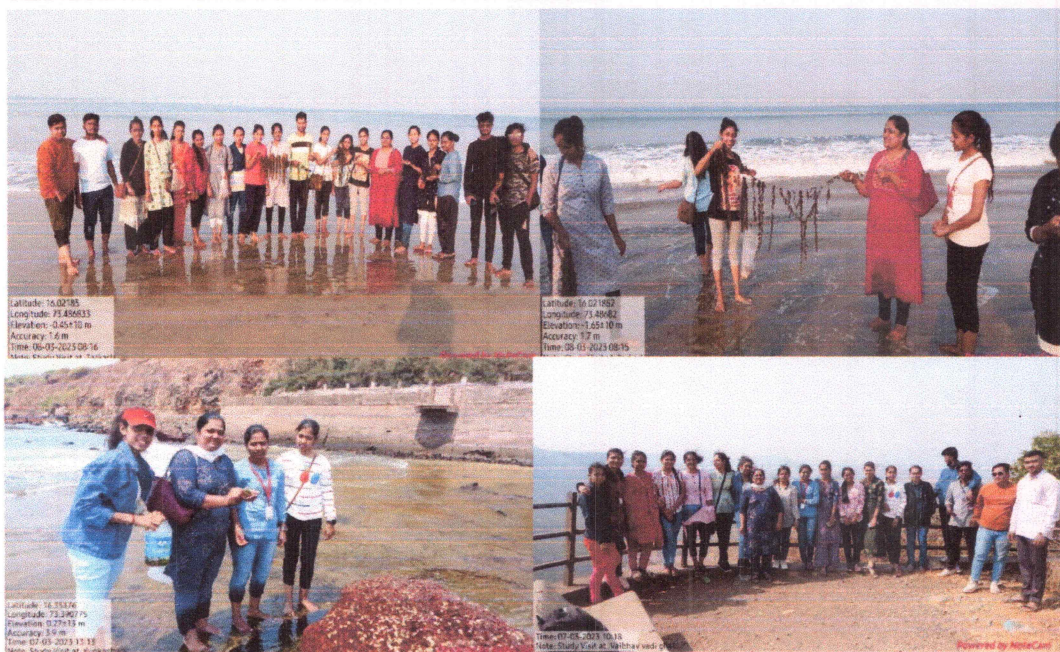
Students collecting Seaweeds at Malvan and Kunakeshwar