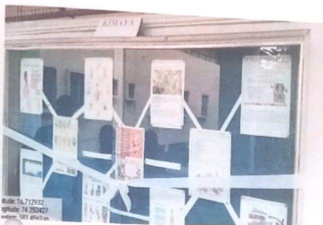
Wallpaper on theme Chemistry in Everyday life