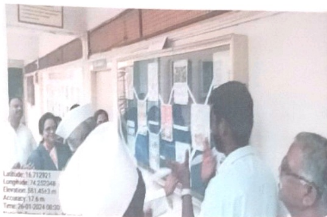
Inauguration of Wallpaper