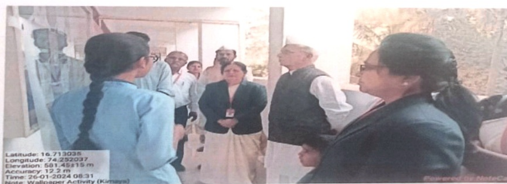
All the Dignitaries and Staff Member Present for Wallpaper