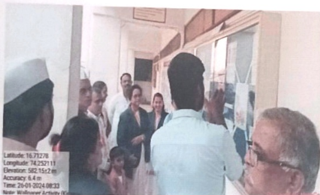
Students Representing Wallpaper