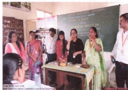
Participants with Staff members