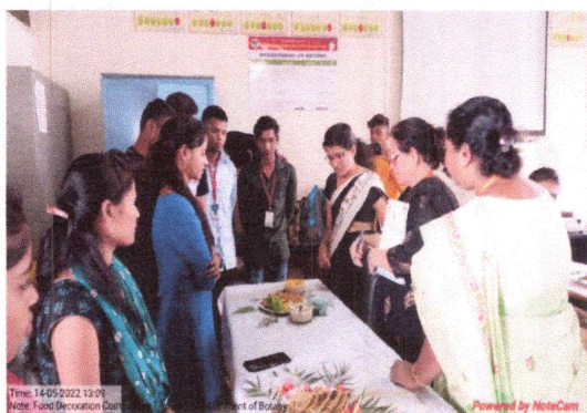
Student interaction with examiner