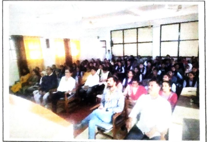
Participants Students and Teachers during the World Tourism Day programme.