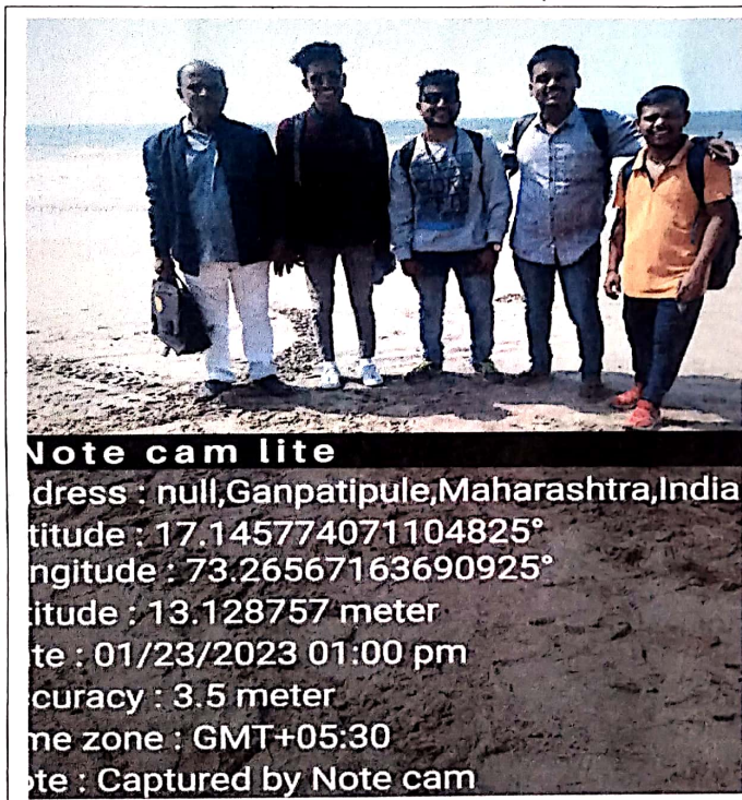
At the time of observing coastal topography