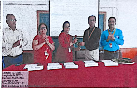
Inauguration of Avishkar Research Convention