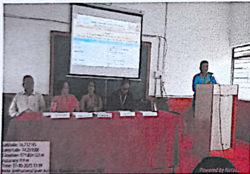
Chief Guest Speech